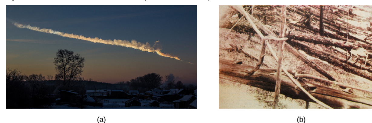
Figure 13.13 Impacts with Earth. (a) As the Chelyabinsk meteor passed through the atmosphere, it left a trail of smoke and briefly became as bright as the Sun. (b) Hundreds of kilometers of forest trees were knocked down and burned at the Tunguska impact site.

Together with any comets that come close to our planet, such asteroids are known collectively as near-Earth objects (NEOs) . As we will see (and as the dinosaurs found out 65 million years ago,) the collision of a significant-sized NEO could be a catastrophe for life on our planet.